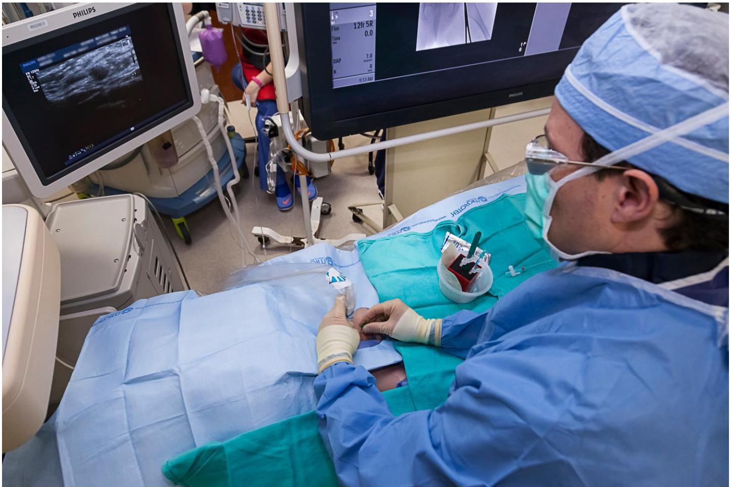
Figure 1. Image of a neuro-interventionalist accessing the femoral artery using ultrasound guidance and standard micropuncture kit.

This project provides evidence that the use of ultrasound guidance for femoral artery access can further enhance the safety of IAC procedure for very small infants that are under 10 kg. Even though there exists scientific literature that infants as small as 2 months old with retinoblastoma can successfully be treated with IAC, most centers do not perform IAC until patients reach a certain weight and age threshold in order to prevent procedural complications. In our study, ultrasound guidance served as an extra safety measure that yielded zero procedural complications. Our study demonstrates that as few as one to three IAC cycles can adequately lead to full regression of retinoblastoma in treatment-naïve eyes in the youngest children. Further prospective studies focusing on the weight limit and administration of IAC to young, treatment-naïve eyes can bring forth a new standard of care.